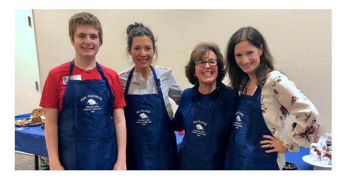
Last year's Passover Dessert Bake-off Winners

Think you make the best challah? Have your challah judged by some of Chicago's toughest food critics. Drop your challah off, enjoy Shabbat services and enjoy some delicious challahs!