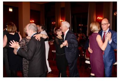
From our Sinai 2019 Gala at Newberry Library.